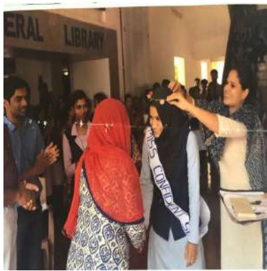
AWARDING THE CONFIDENT