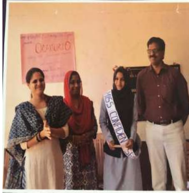
MISS CONFIDENT S.E.S